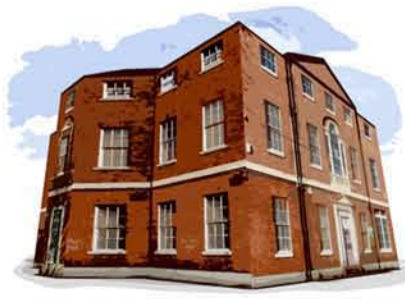
MOUNT PLEASANT RETIREMENT VILLAGE